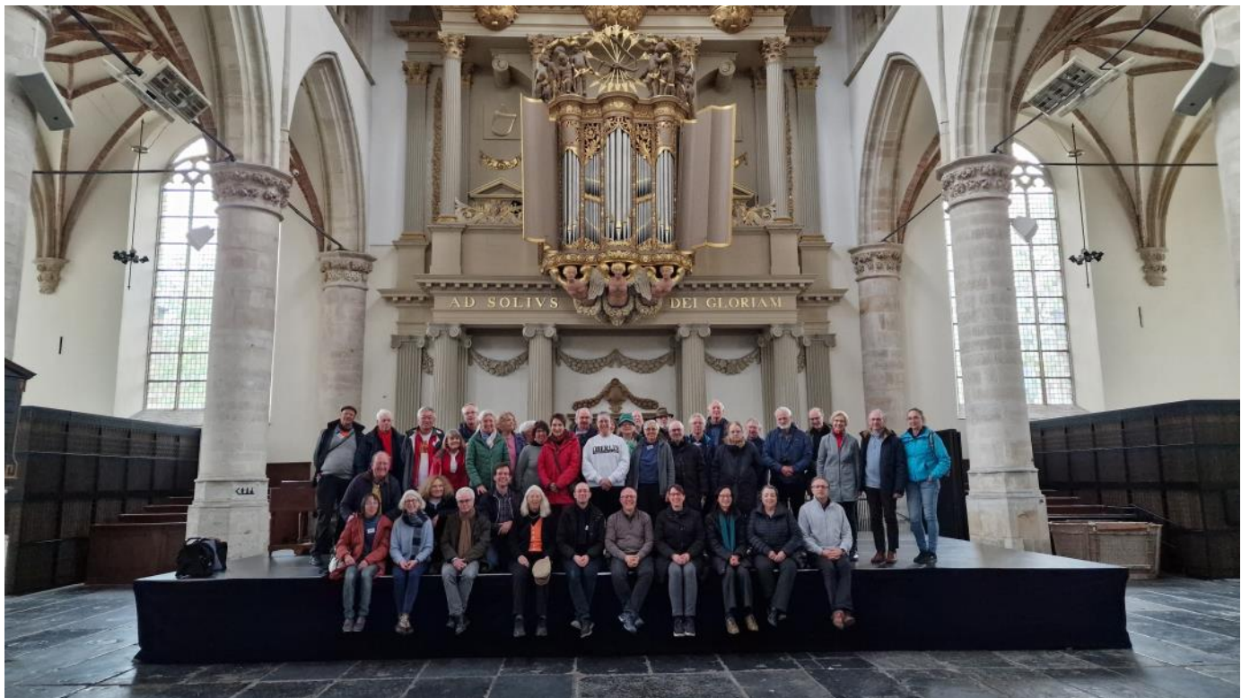
Group photo taken in the Grote Kerk in Alkmaar.