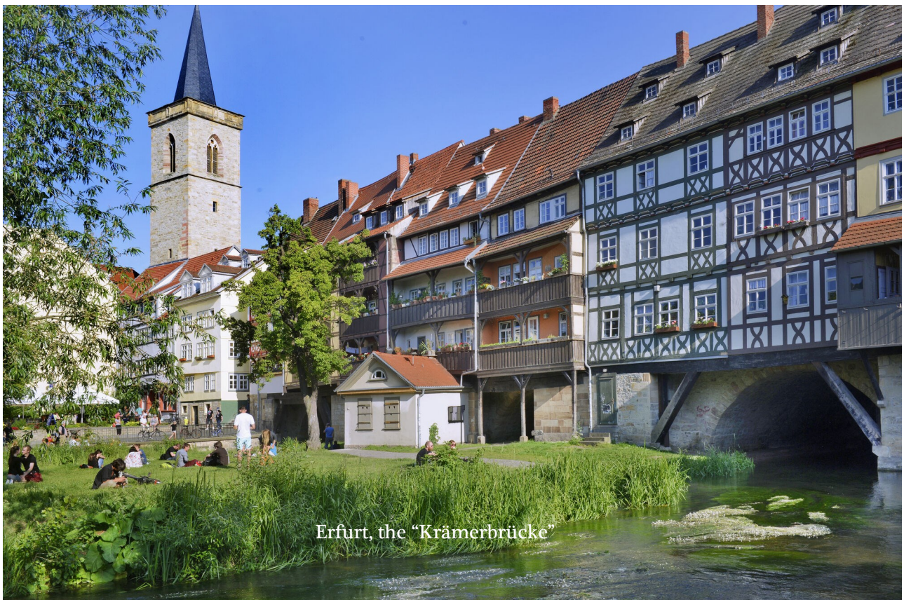
Erfurt, the "Krämerbrücke"